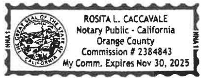
Place Notary Seal and/or Stamp Above

I certify under PENALTY OF PERJURY under the laws of the State of California that the foregoing paragraph is true and correct. WITNESS my hand and official seal.