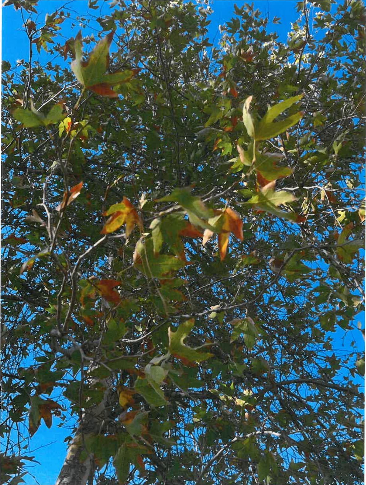
Anthracnose on the leaves.