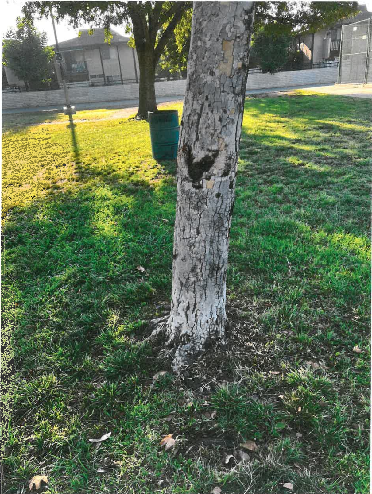
Wounding on the trunk from mechanical damage.