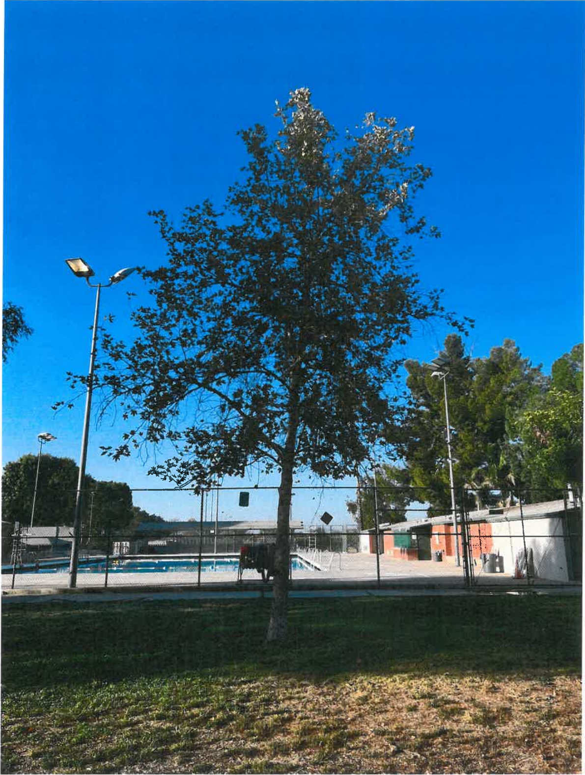
Location of the subject tree in fair condition with good structure.