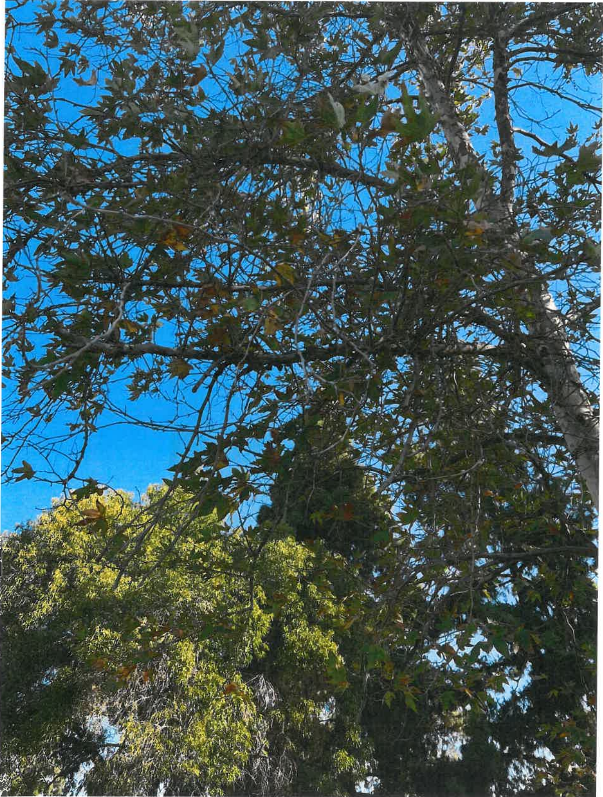
Small dead twigs in the canopy.