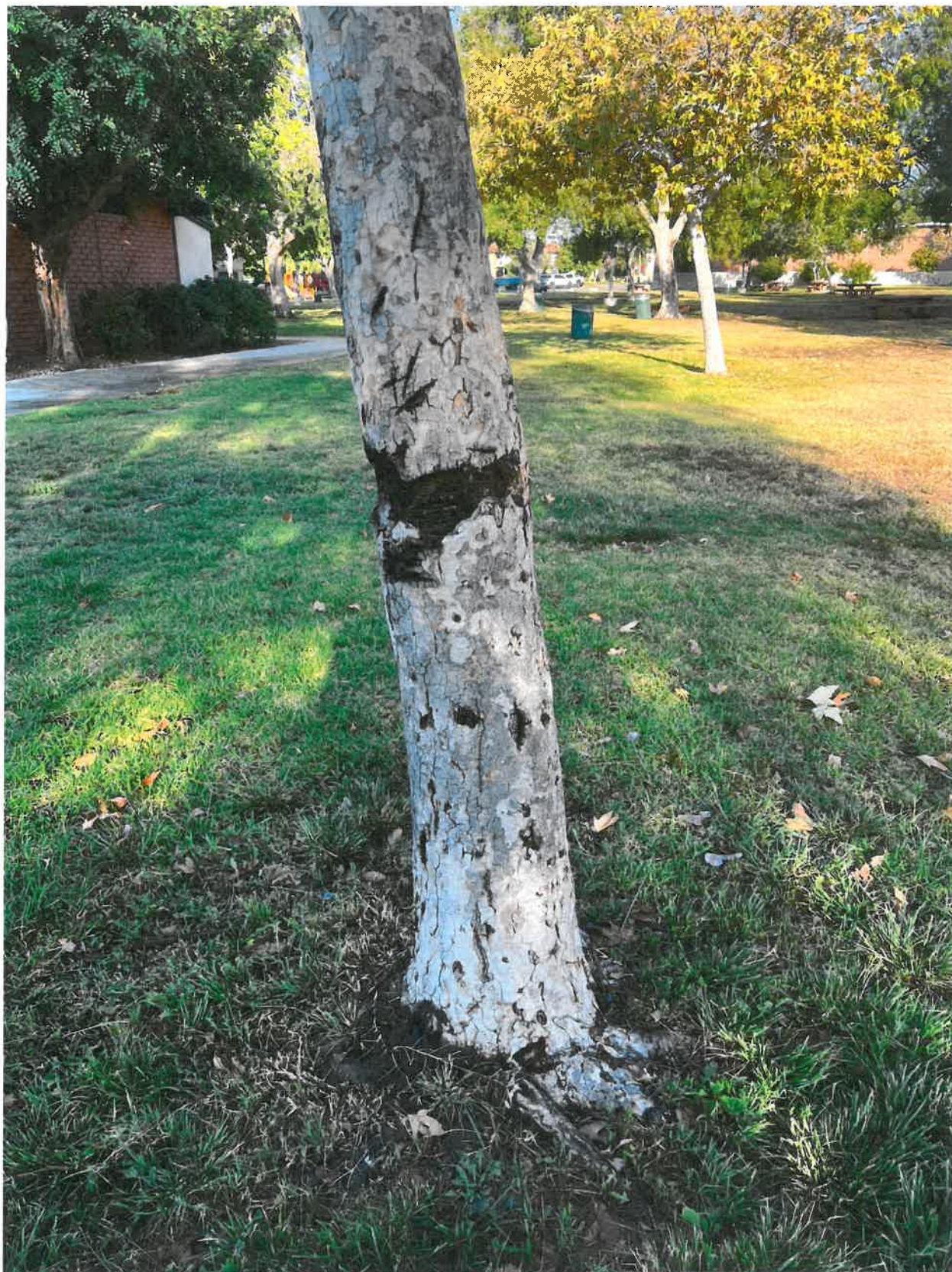
Wounding on the trunk from mechanical damage.