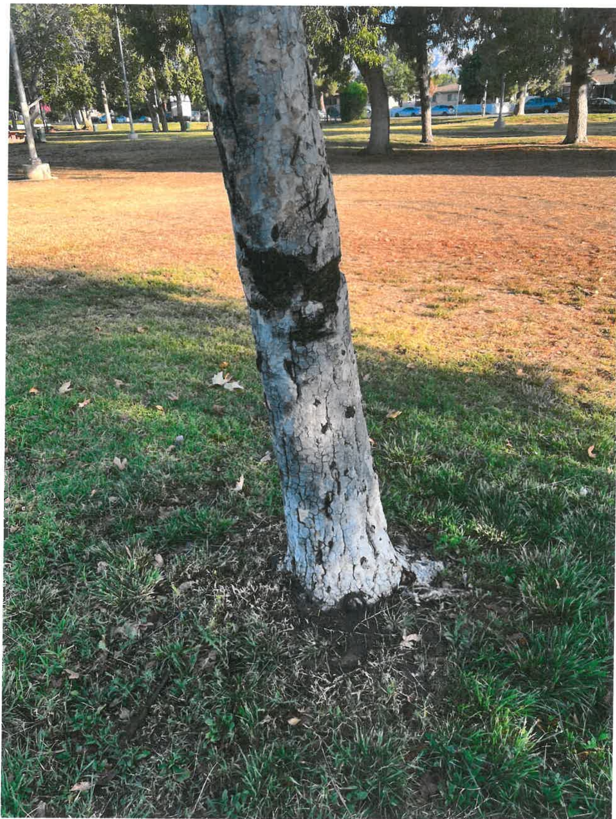
Wounding on the trunk from mechanical damage.