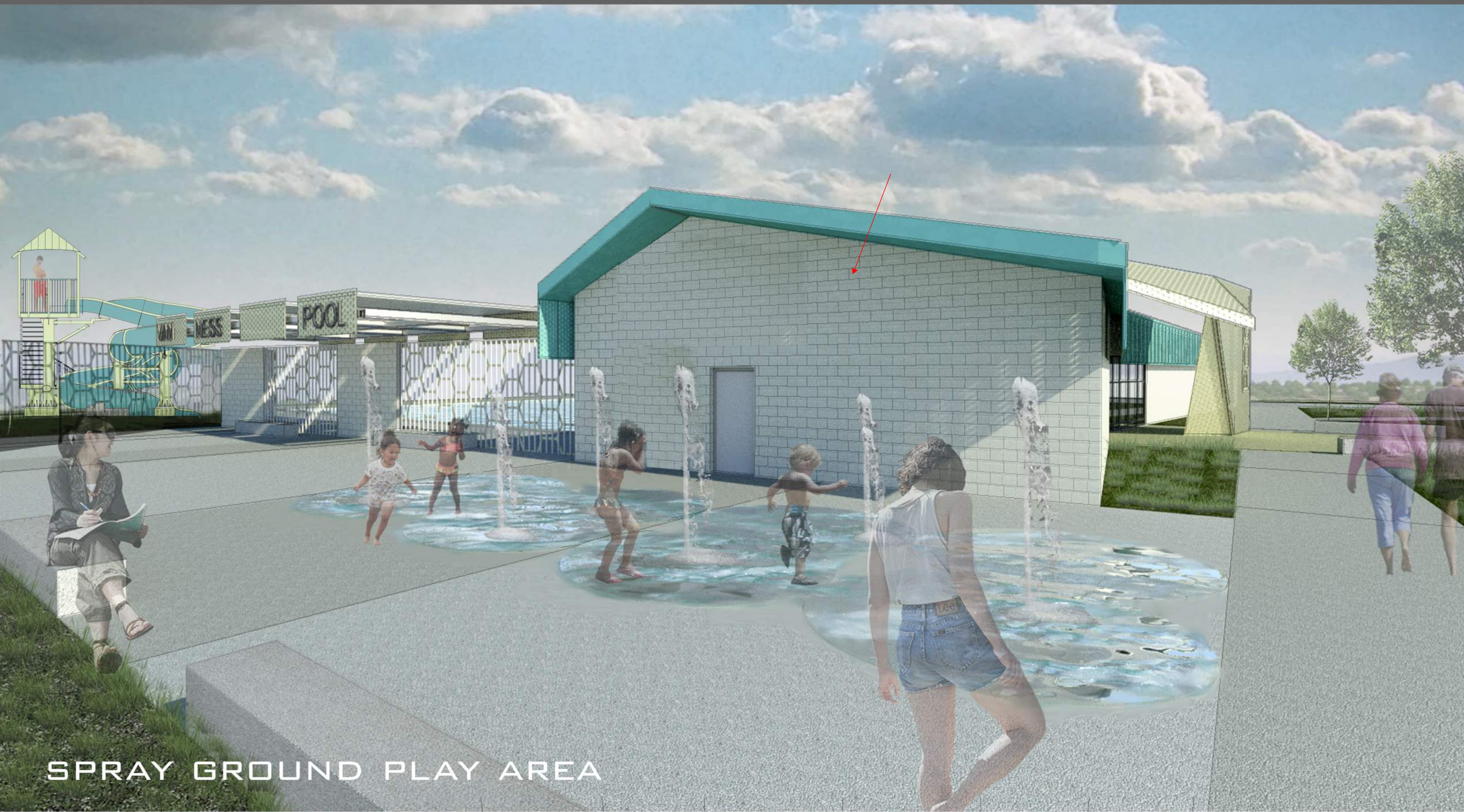
SPRAY GROUND PLAY AREA