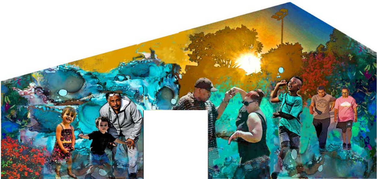
Van Ness Pool Bathhouse – East Wall