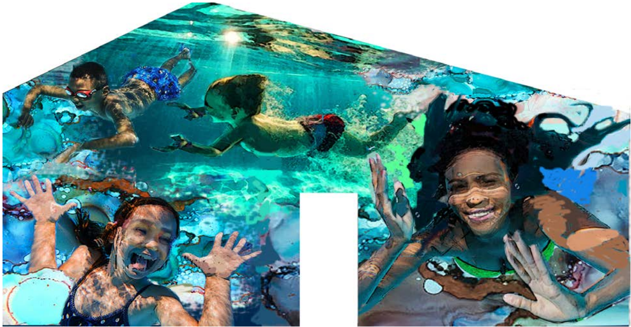
Van Ness Pool Bathhouse – West Wall