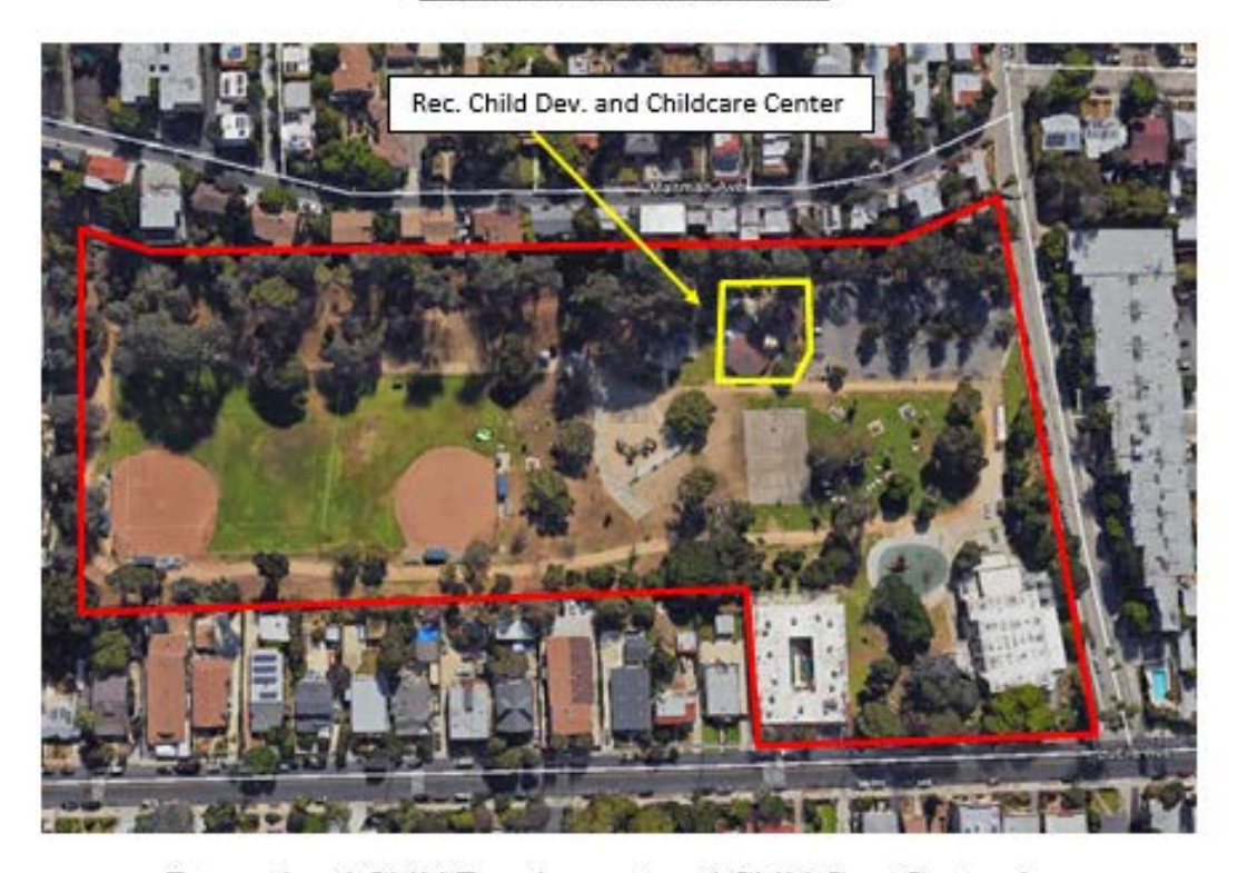
Recreational Child Development and Child Care Center Area