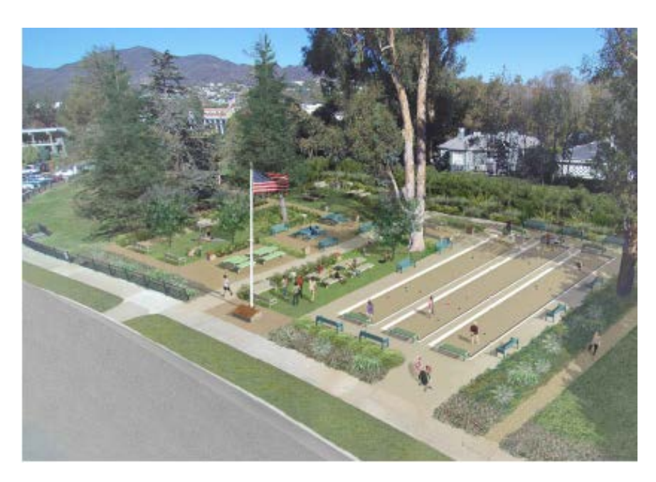
Exhibit B Project Design Illustration and Recognition Signage Locations