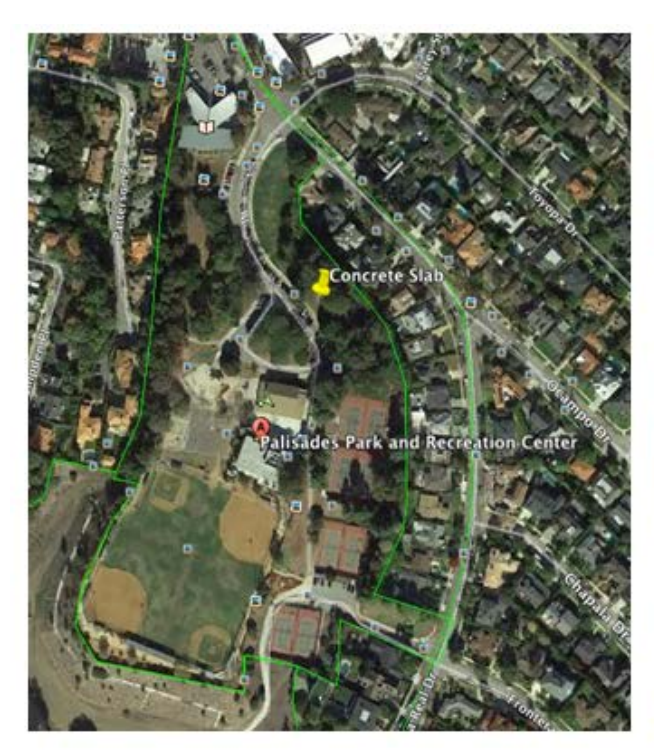
Grove Proposed for New Picnic Area