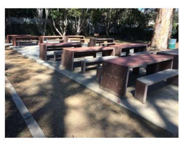
Existing Picnic Area and Concrete Slab