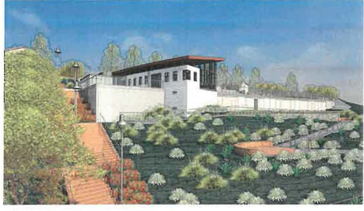
VIEW FROM ACROSS GAFFEY STREET