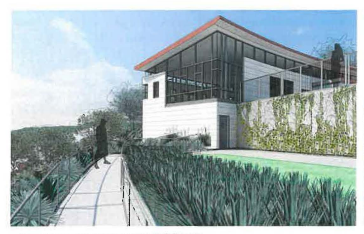
APPROACH TO POOL HOUSE FROM GAFFEY STREET