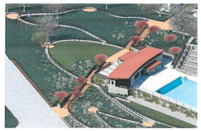
NORTHEAST AERIAL VIEW