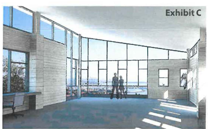
COMMUNITY SPACE LOOKING OUT TO SAN PEDRO PORT