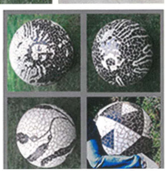
Mosaic Balls - Sculptural Seating