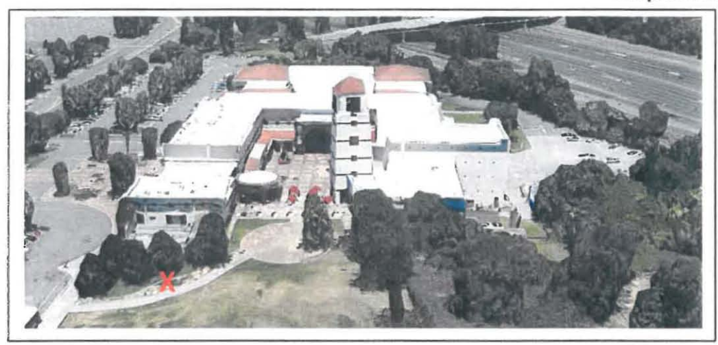
Exhibit A Proposed Sculpture Location