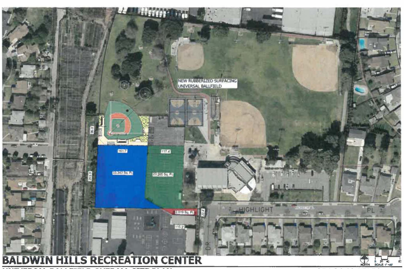
Exhibit B Overall Site Plan

UNIVERSAL BALLFIELD OVERALL SITE PLAN 3-4-15 MANL