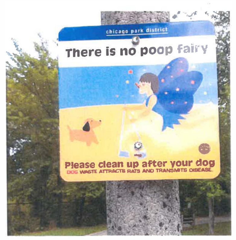
Example of an etiquette design used at the Chicago Park District