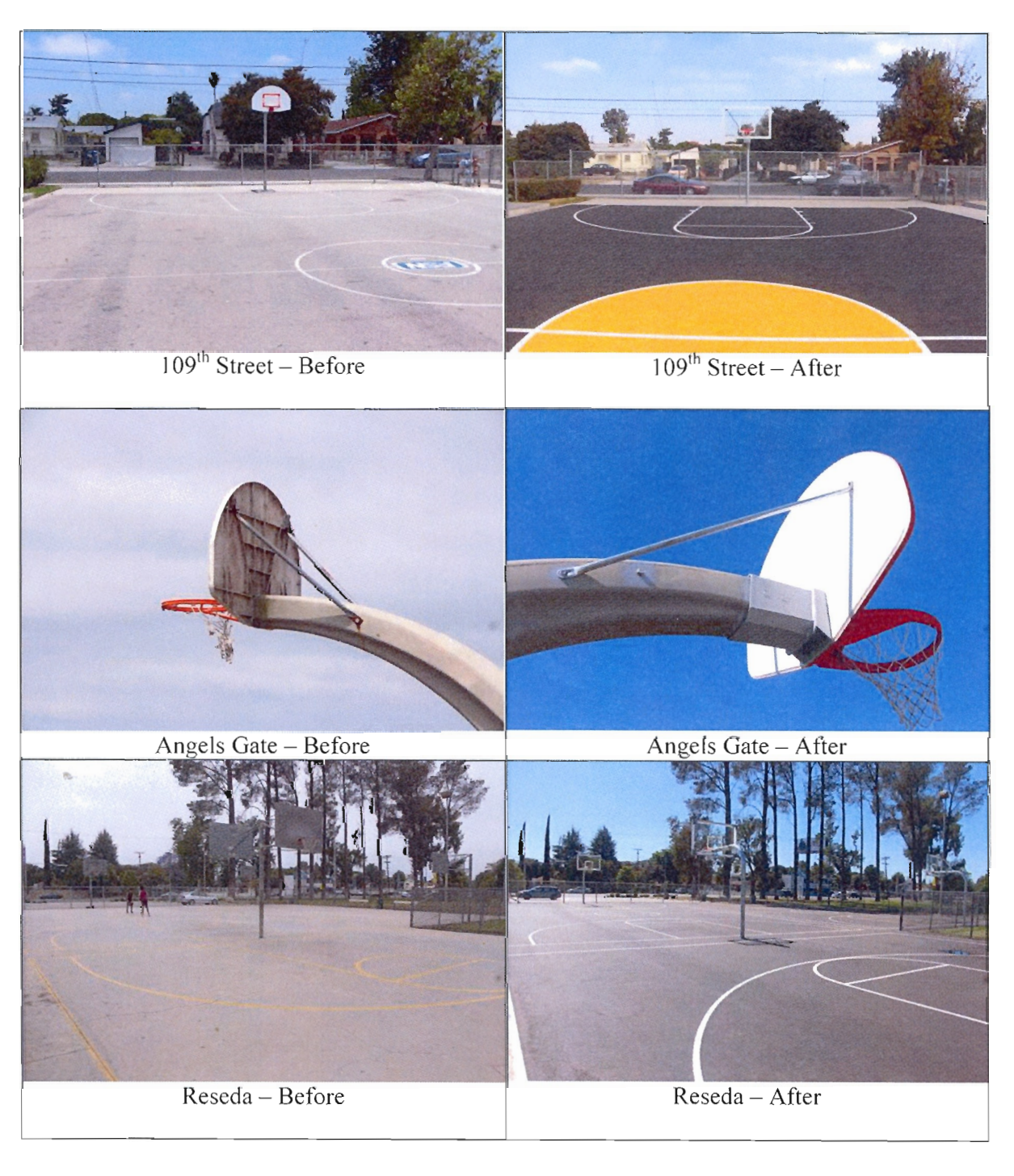
Exhibit A Before and After Photos