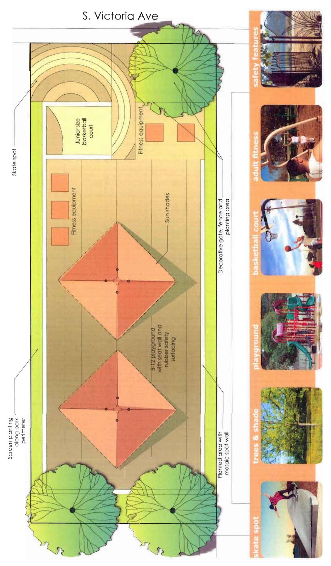
South Victoria Avenue Park Concept Design

The Trust for Public Land ~ City of Los Angeles Recreation and Parks Statewide Park Development and Community Revitalization Program Application