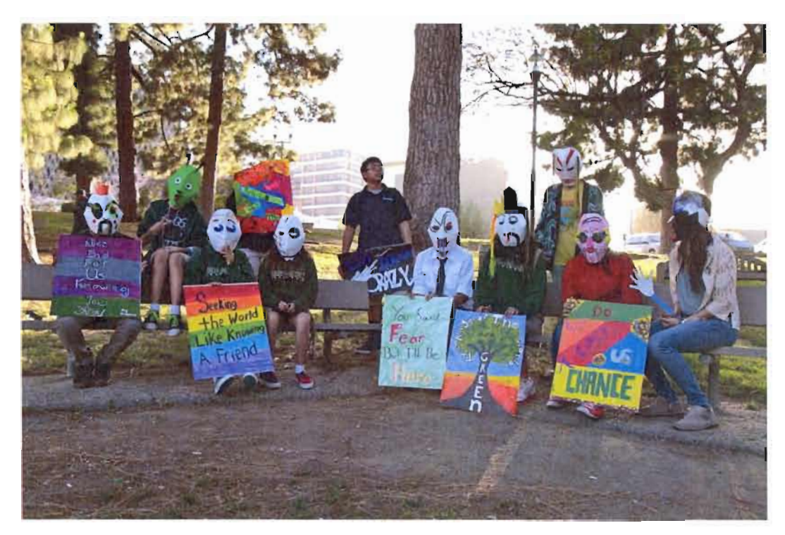
Youth Design Meeting