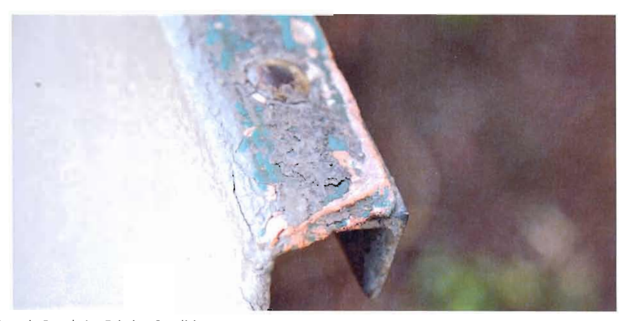
Sample Bench 1 – Existing Condition