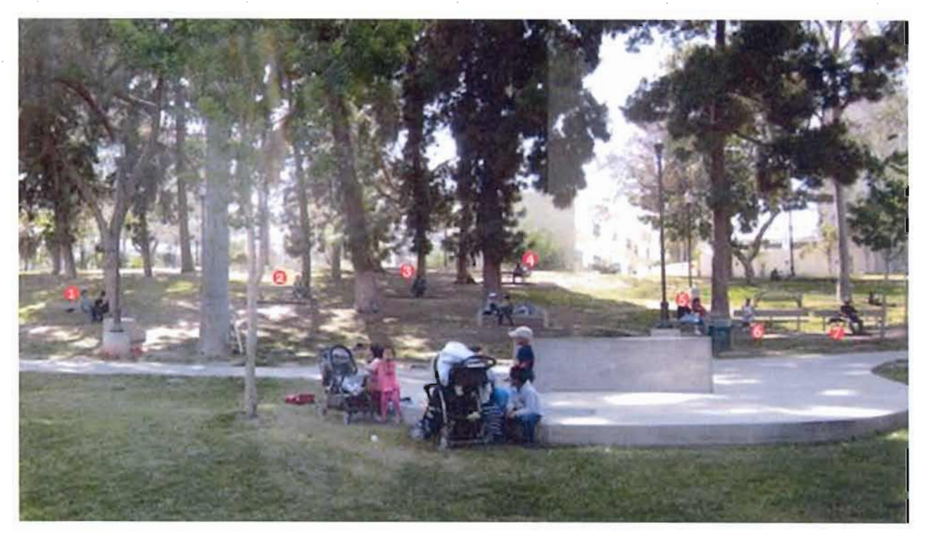
Location of Benches within MacArthur Park