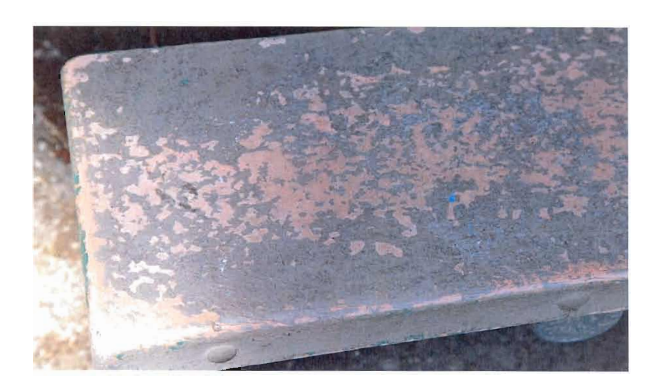
Sample Bench 2 – Existing Condition