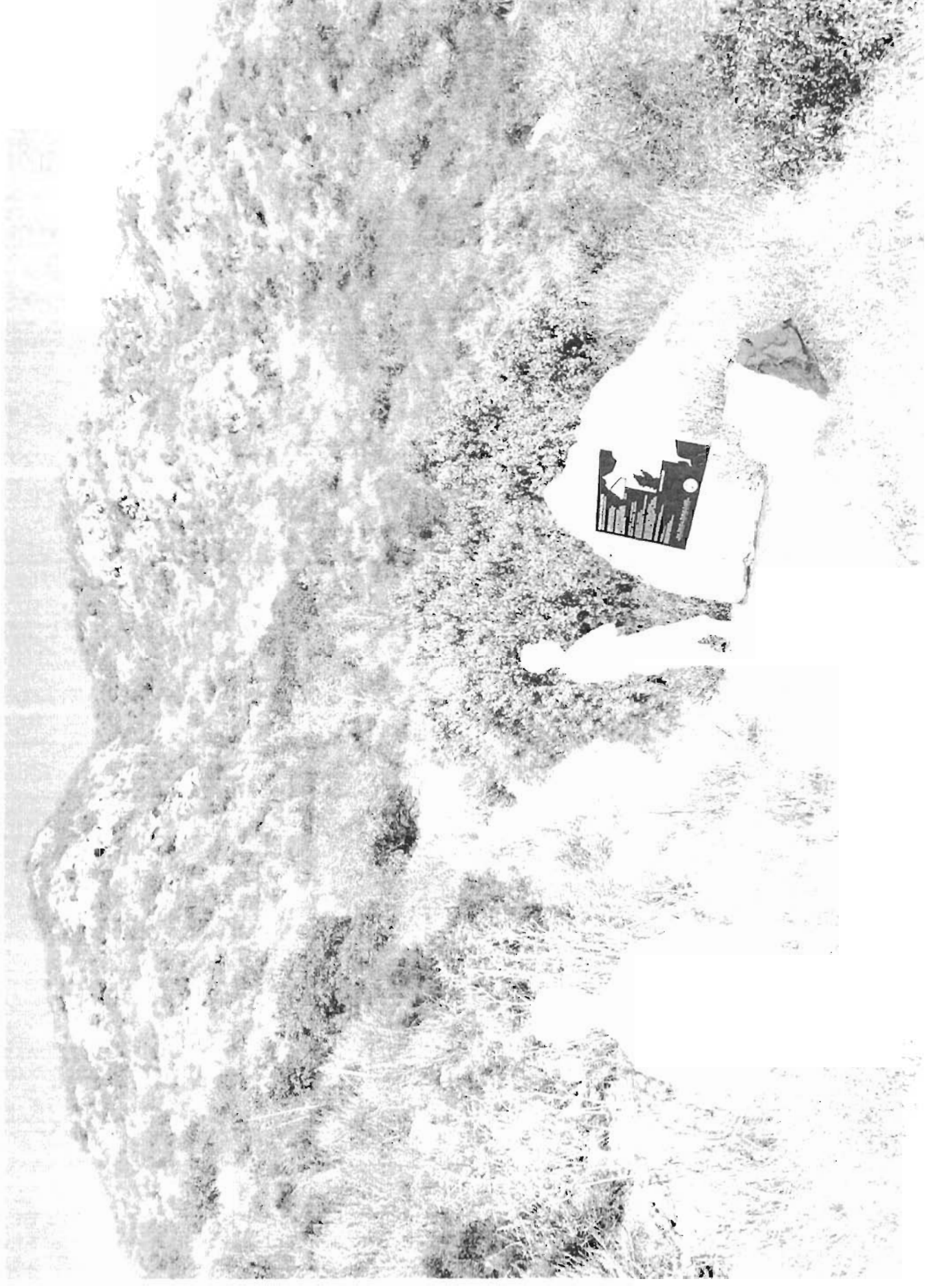
Plaque Site Perspective: Location No. 1