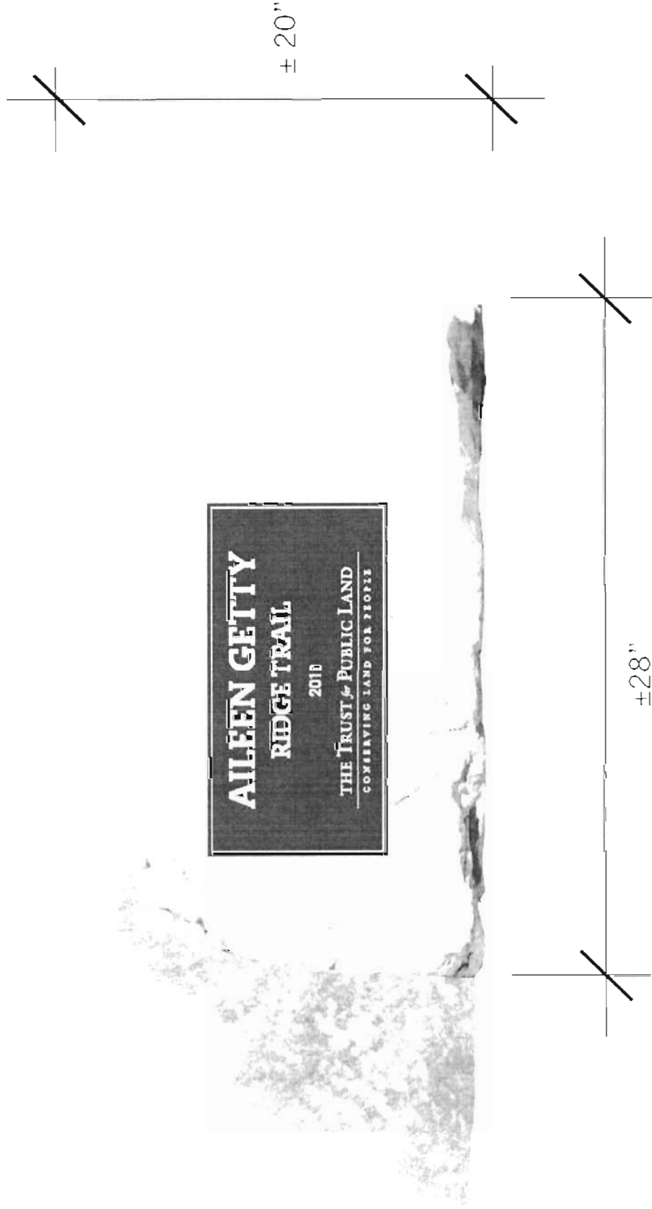
TRAIL PLAQUE ILLUSTRATION