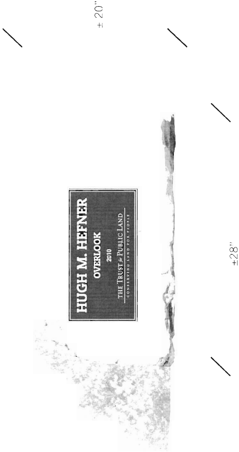
TRAIL PLAQUE ILLUSTRATION