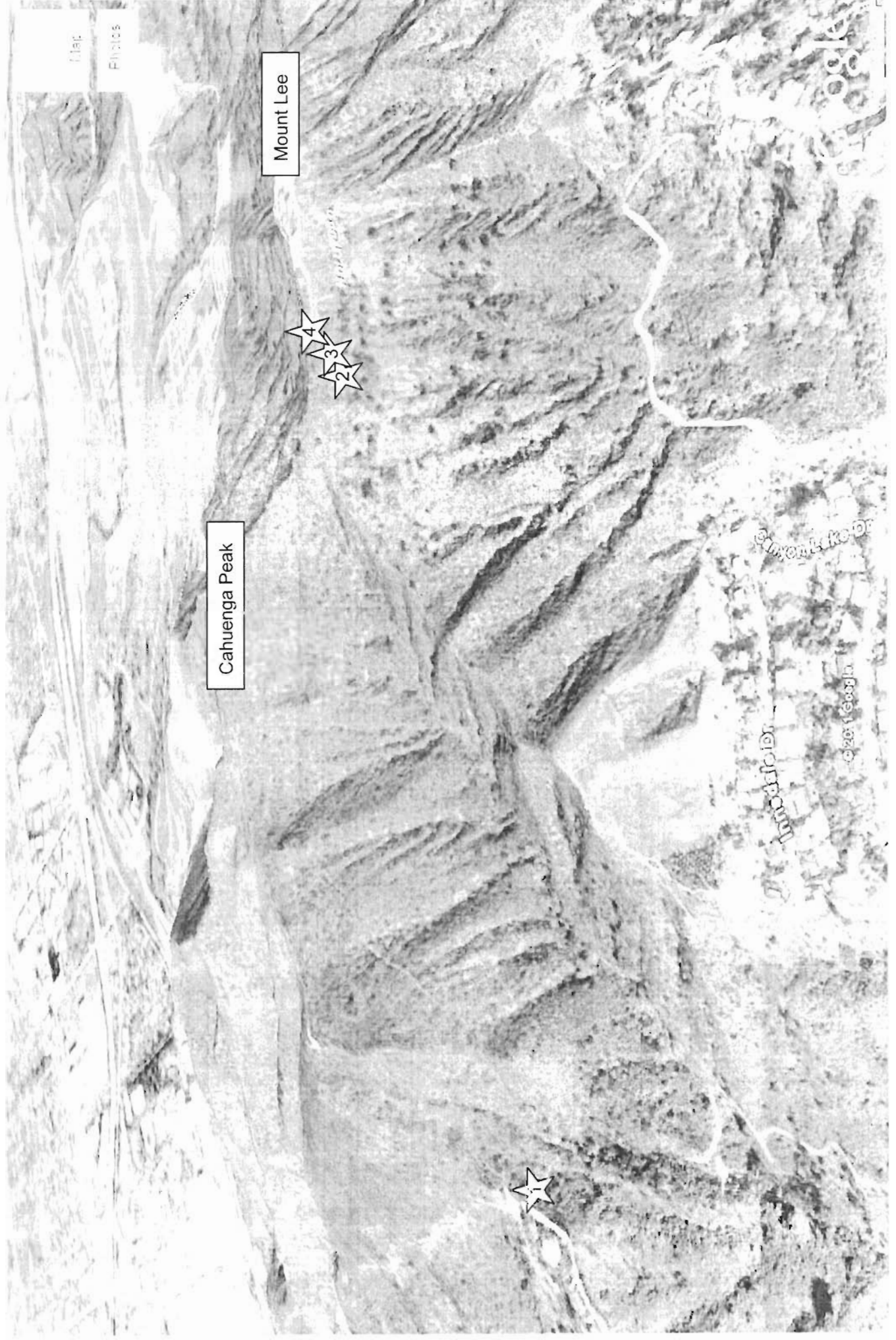
Proposed Plaque Locations