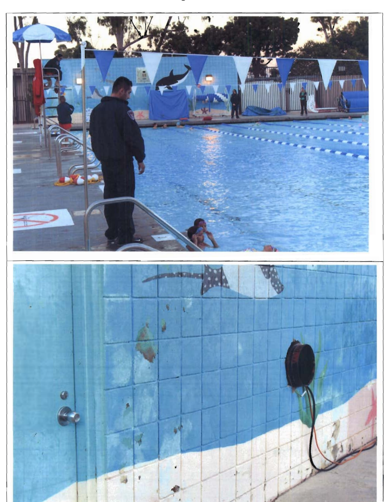
Exhibit A – Existing Mural Location and Condition