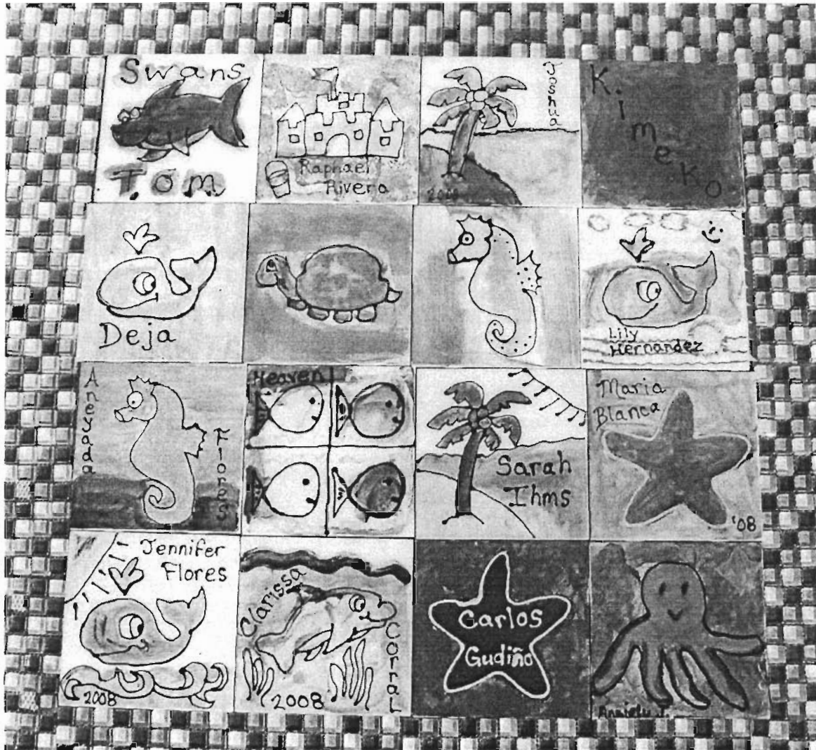
Small scale example of the proposed project for the pool