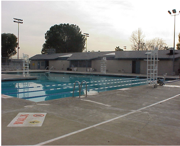
Major repairs performed by the Department of Recreation and Parks have kept Hubert Humphrey in fair condition.

Five pools served 76,758 swimmers in 2003.