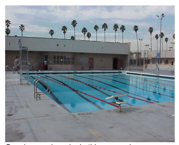
Banning needs major bathhouse work.