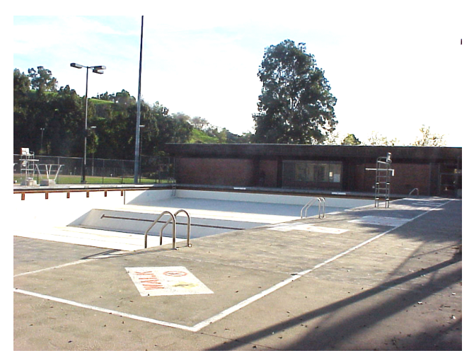
Glassell has been modified for year-round use as an interim substitute for patrons of Echo Deep while that pool and building is rebuilt

Glassell, refurbished in 1981, is open year round temporarily as an alternative for Echo Deep patrons, since Echo closed in 2003; Glassell needs a new deck and bathhouse. Echo Shallow should be relocated away from the Freeway, and Hollywood has substantial repair needs. This District also features Echo Park Lake, where boat rentals are supervised by the Aquatics Division