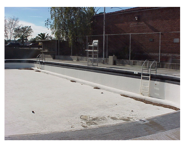
Echo Shallow, encircled by a 101 freeway onramp, is too "freeway close."