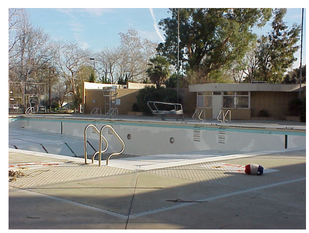
Lanark - Closed, but funding is in place to design and built a replacement