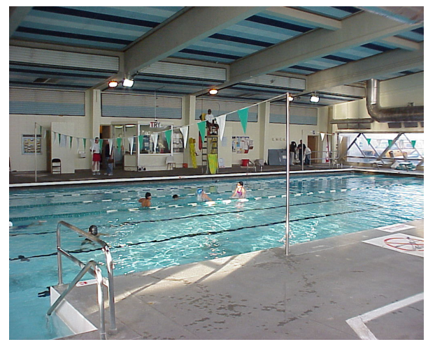
Celes King III, the only open pool in the 10<sup>th</sup> District at the start of the 2004 swim season, is also a year round pool.

Without the benefit of seasonal pools, this District has also been seriously impacted by the closure in 2002 of E.G. Roberts, which is currently under major renovation and is scheduled to re-open later this summer. Celes King is in need of some repair, but identifying locations for additional pools is also a priority.