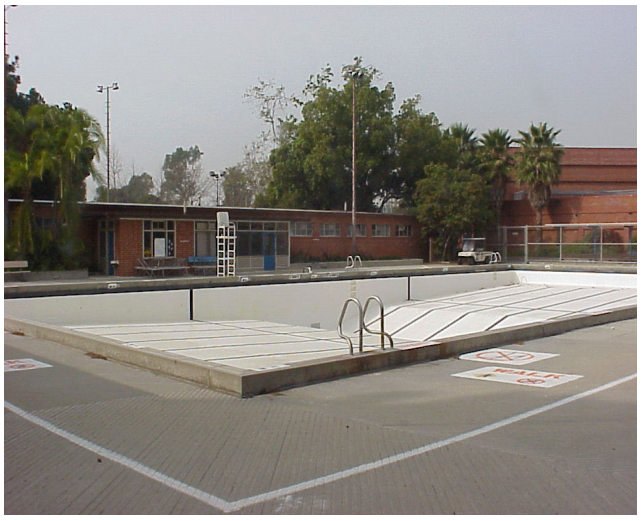
Pool concrete particularly needs replacement at Cheviot Hills.