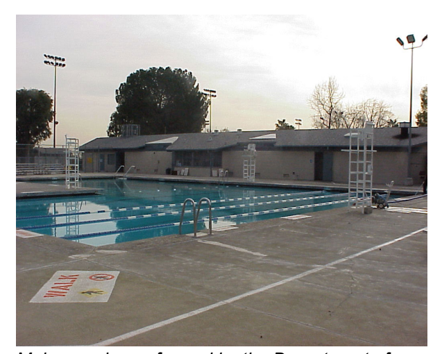
Major repairs performed by the Department of Recreation and Parks have kept Hubert Humphrey in fair condition.