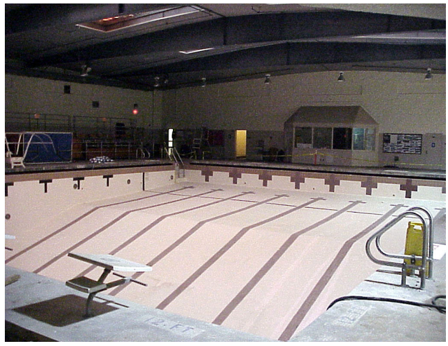
A refurbished E.G. Roberts will reopen later in the summer of 2004