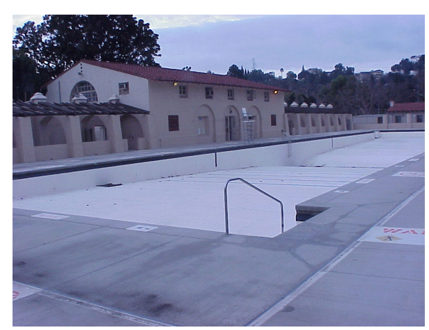
Griffith Plunge—about twice the size of a typical neighborhood pool