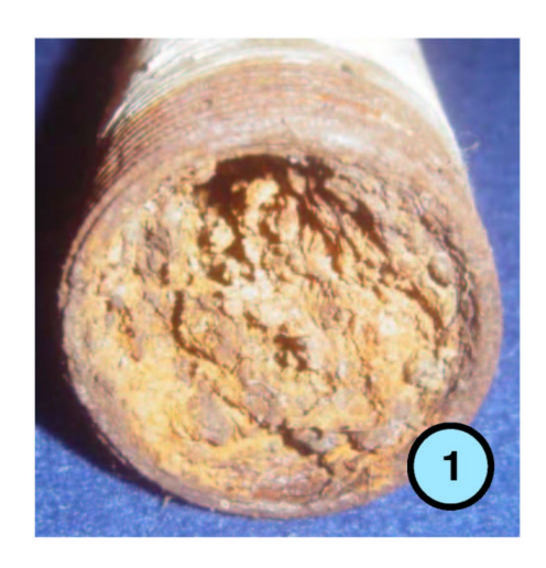
Detail of clogged and rusted pipes from the Pool Repair sketch–an example of the problem at Granada Hills