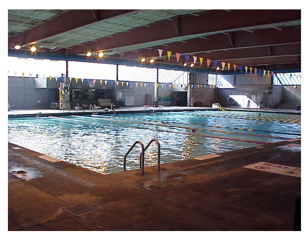
Closed for Renovation - Echo Deep

All pools in this Council District have been repaired repeatedly and are in imminent danger of failure. The #1 priority for pool replacement city-wide is Lincoln, the #3 priority is Downey, and the #12 priority is Highland Park. Echo Deep is already closed for major renovation. This District also features MacArthur Park Lake, where boat rental use is supervised by the Aquatics staff.