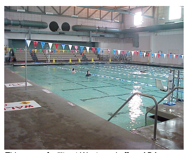
This newer facility at Westwood offers ADA accessibility.

While Westwood is a newer pool in fair condition, needing only minor renovation, Cheviot Hills requires major repair and renovation due to its age. Although there are areas of higher income in this District, additional pools are needed to serve residents with swim lessons and programming.