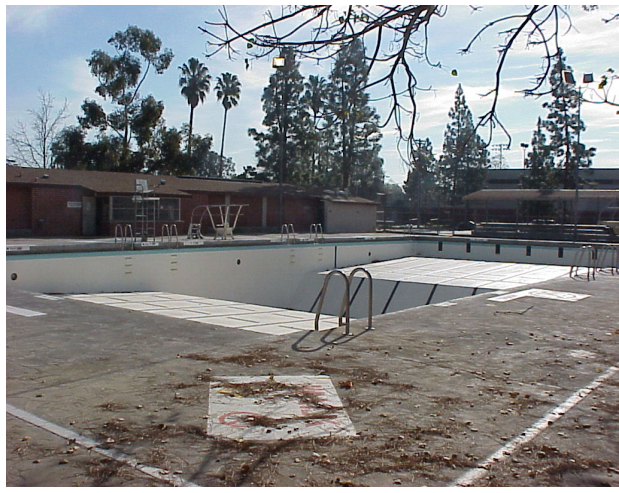
Valley Plaza needs to be replaced.

Although Valley Plaza is in grave need of replacement, Verdugo Hills pool received major refurbishment in 2002, including a new deck, and Van Nuys/Sherman Oaks has reopened this summer as a rebuilt, year-round pool.