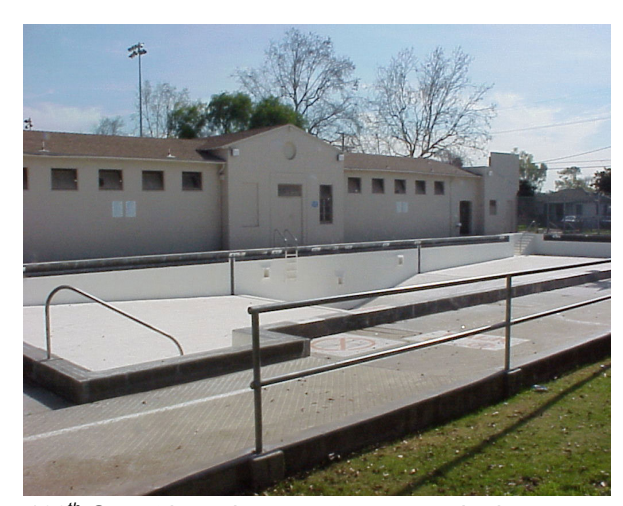
109<sup>th</sup> Street is an important resource in the community, but needs to be replaced