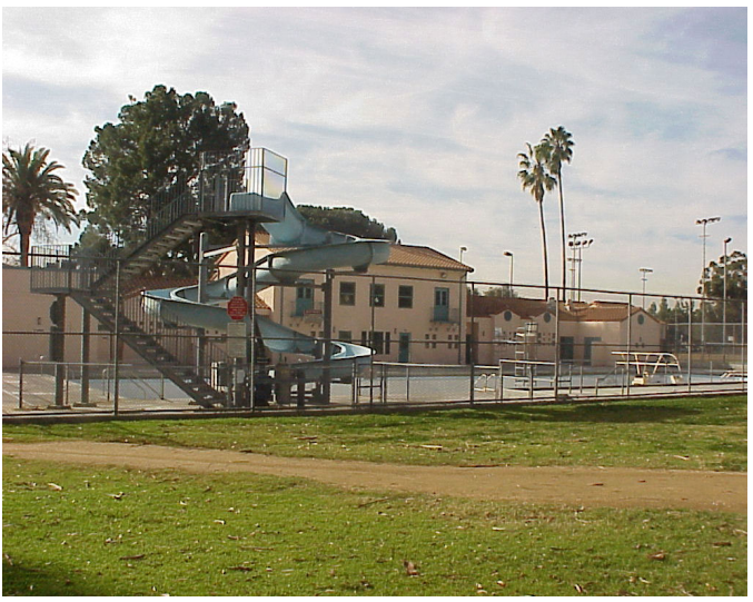
This older pool in Sun Valley, in fairly good condition, is testimony to the longevity in our pools with the experienced care and periodic refurbishment performed by Recreation and Parks Facility Repair staff.