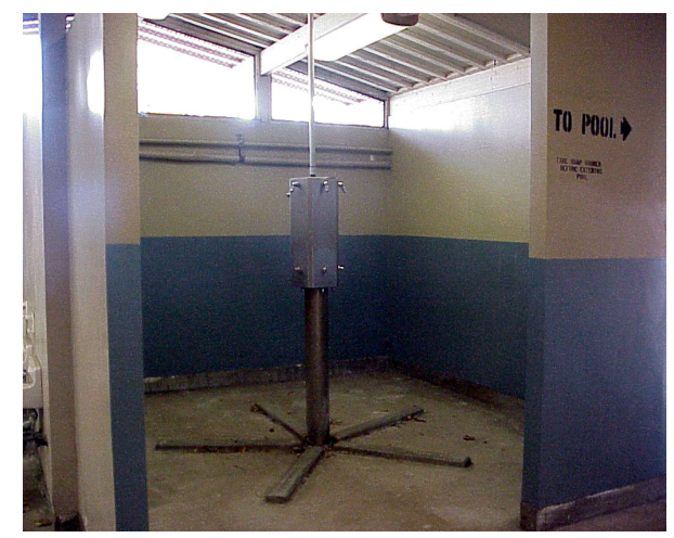
Much of work needed at the pools is in the bathhouse, as seen in this view of the Fernangeles shower room for boys.