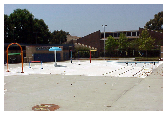
The new Stoner Family Aquatic Center opened in 2003.