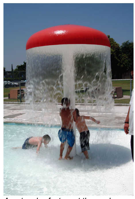
A water play feature at the newly rebuilt Van Nuys Sherman Oaks pool.