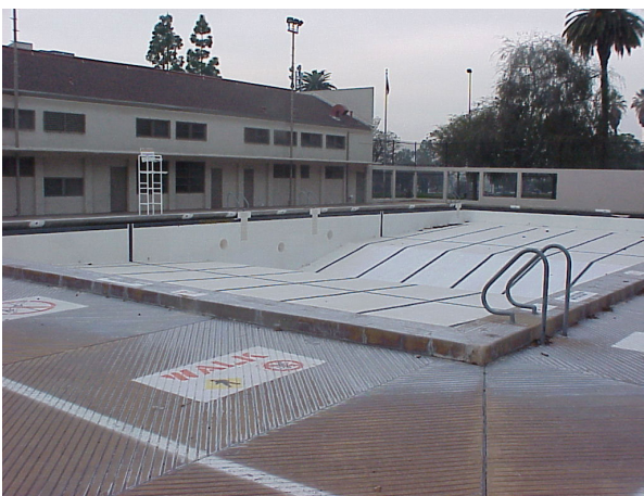
Lincoln Park Pool–the #1 replacement priority for the Department city-wide