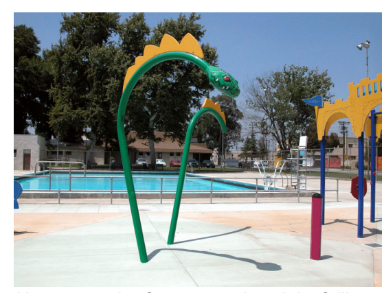
New water play features replaced the failing small pool at North Hollywood

Major repairs and the addition of a splash pad are helping to sustain North Hollywood facility through another season, but the pool needs to be replaced. Although both Griffith Park and Pan Pacific need major renovation, Griffith Park is benefitting from a new equipment room in 2000.