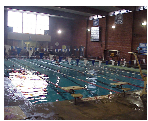
Leaking pipes at Venice make keeping the pool open a daily challenge.

The year round pool in this District, Venice, is operating on a day-to-day basis because of severely leaking pipes and a leaking roof; it is #4 priority for replacement. Mar Vista and Westchester both require major refurbishment. Stoner, rebuilt as a family aquatic center with slide and other play features in 2003, is an excellent model for a new style of recreation and park aquatic facility.