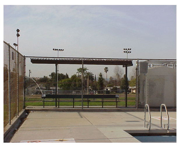
Sylmar Pool needs replacement.

Hansen Dam operates on an extended season of April to October, but not year round. The Aquatics Division also oversees the fishing lake at Hansen Dam.