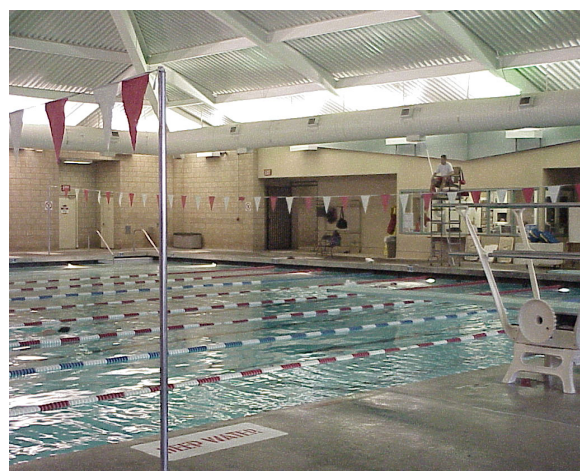
Cleveland is a newer pool, but the bathhouse, HVAC, and electrical room need major renovation.

Lanark has been closed since 2002, which has placed more pressure on the other pools in this area of the Valley. Early in June, the Mayor and Council announced funding to design and construct a new pool for Lanark. Meanwhile, Woodland Hills needs renovation, while Reseda is #11 in priority for replacement.