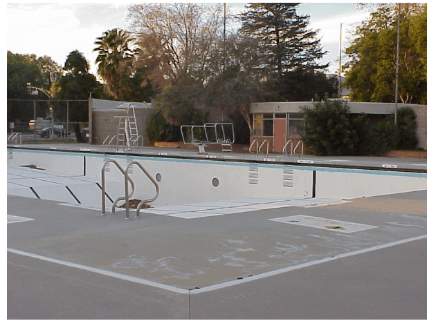
Funding has been identified to replace Northridge pool, based on a plan with input from the community