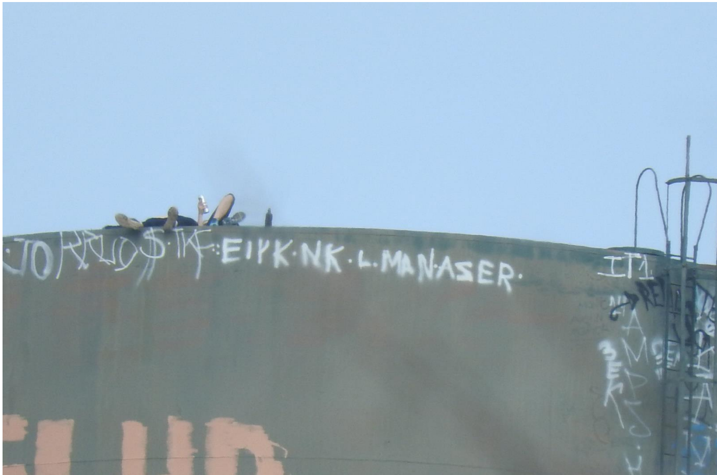
January 2016 – Tank #116