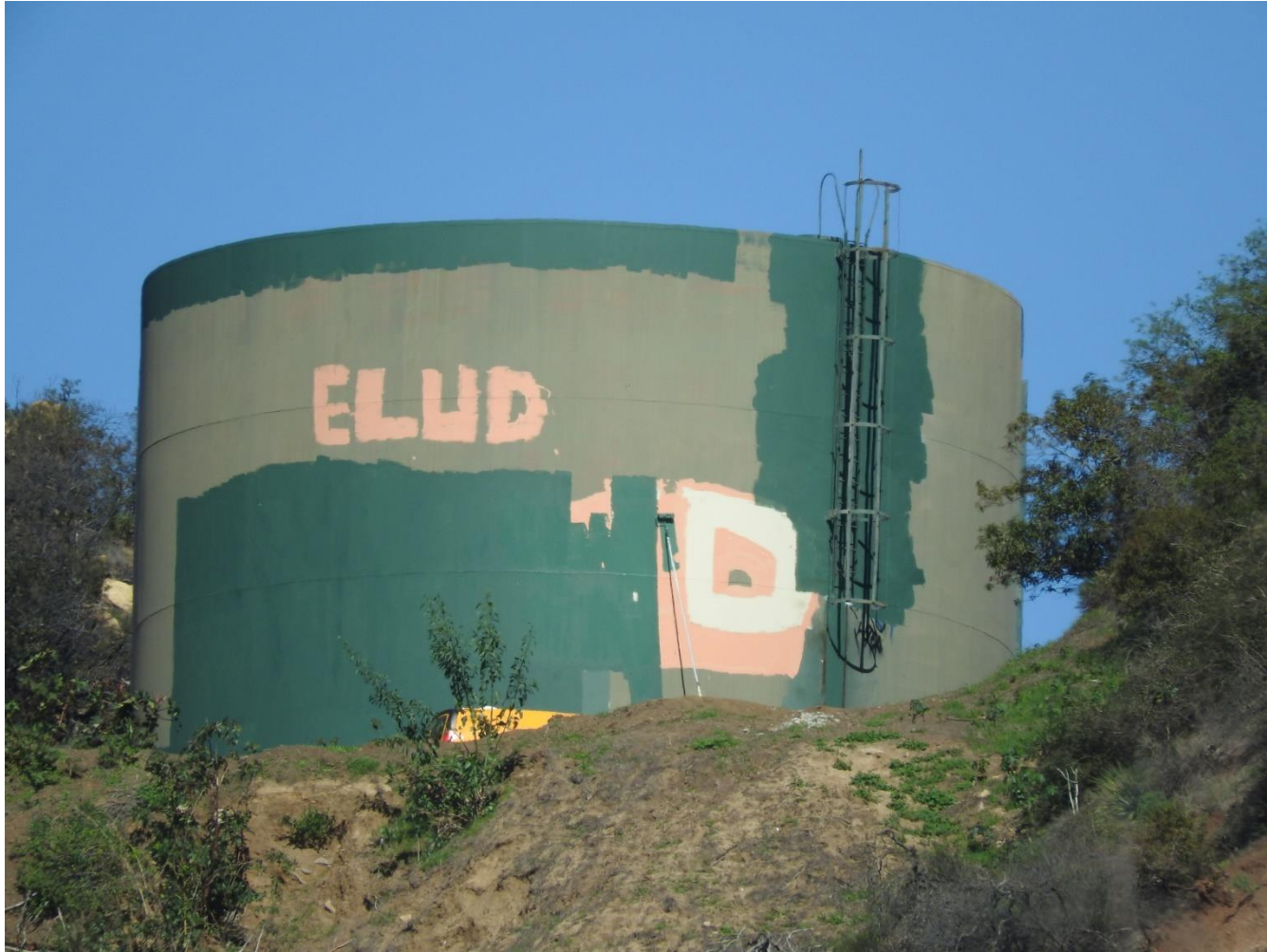
February 2016 – Tank #116