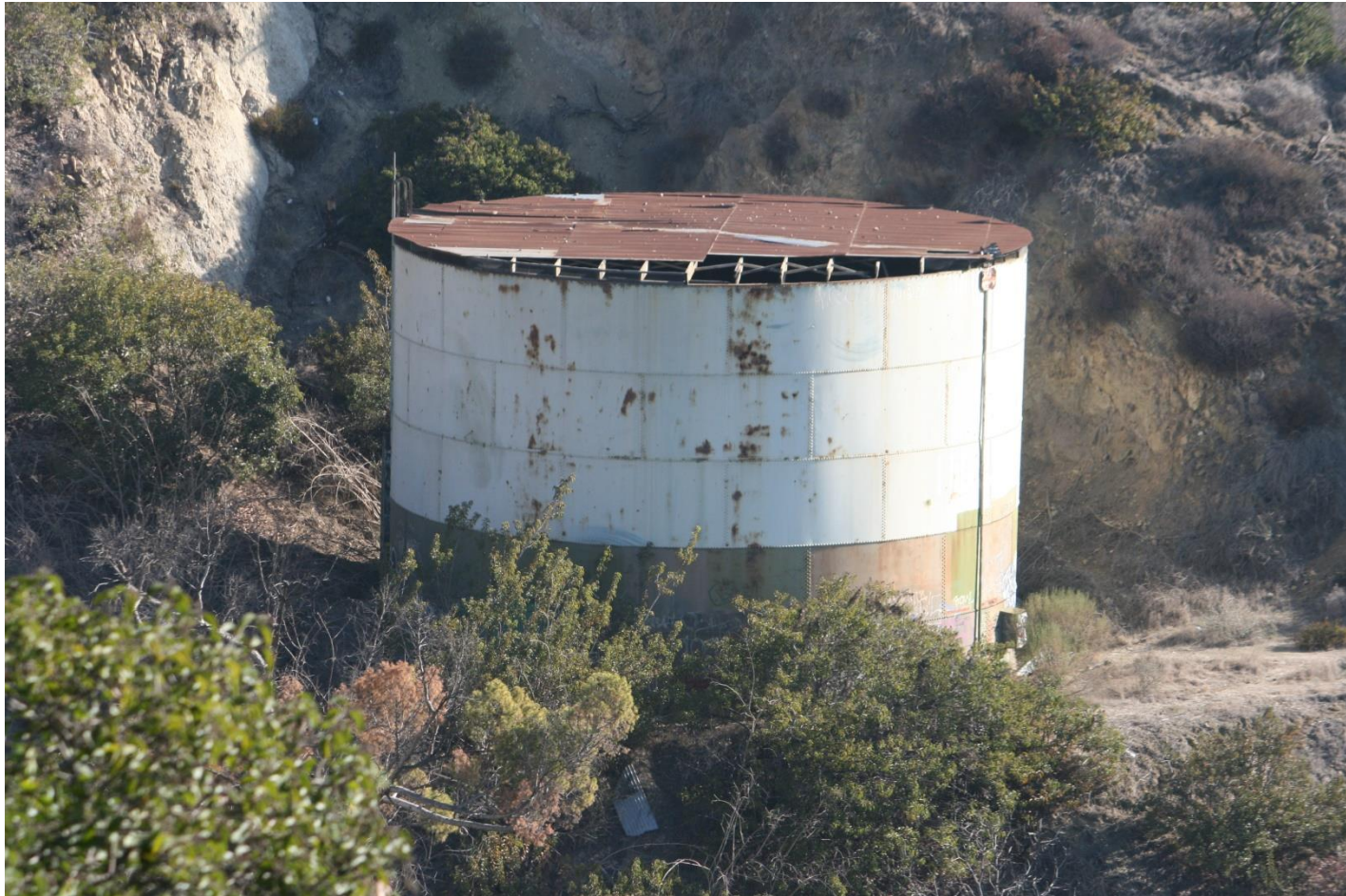
Tank #115 - August 2016

The view hikers have from popular Mt. Hollywood Trail. This tank has a soft roof and ladder access.