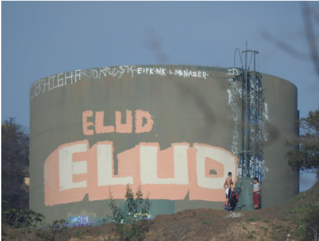
January 2016 – Tank #116

The problems of abandoned tanks are unquestionable. Public Safety - Aesthetics – Maintenance