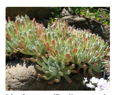
Liveforever (Dudleya spp)

It can be sited on a border or as a backdrop, or grouped for a low screen.