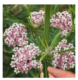
Milkweeds (Asclepias fascicularis)

PLANT LIST These are a few of the hundreds of native plants which we would draw from in creating the Butterfly and Pollinator Garden: